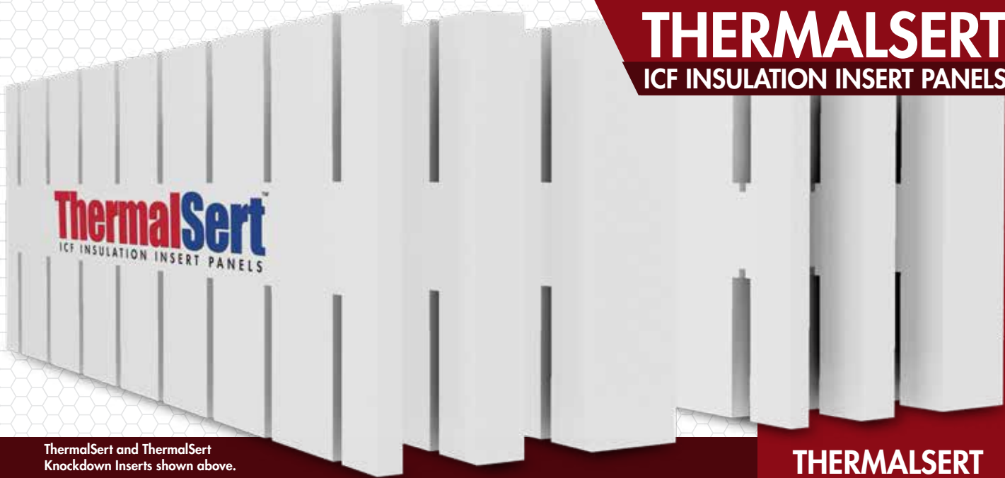
ThermalSert and ThermalSert Knockdown Inserts shown above.